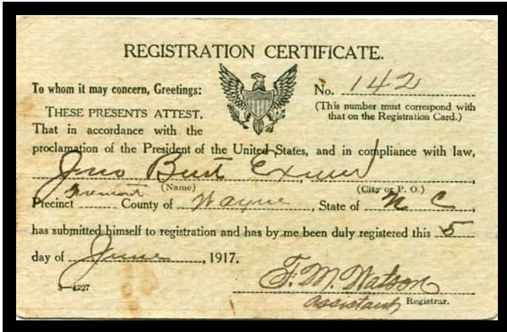
Registration certificate example. Not Chatham.

Men were given certificates to prove they had registered. The certificate was embossed with an eagle at the top and merely stated who had registered, where, and on what date. This certificate was signed by a registrar. An example from North Carolina is shown below. If you have one of these from Chatham, please share an image with us for our collection!