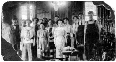
1915 Bynum Cotton Mill

A group from Bynum is working to get Bynum on the National Historic