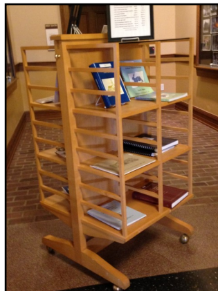
Two display cases donated by Beth Whitacre are extremely useful to the Museum for displays and storage.