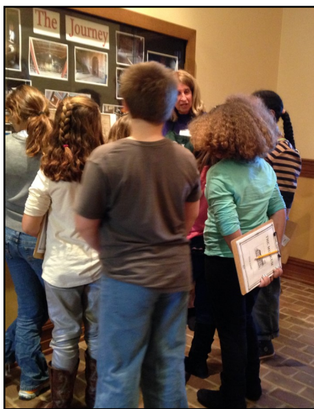
4th Graders learning about Chatham's history.