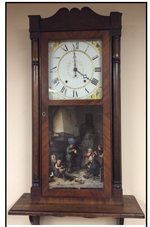
The Parham clock donated by Harvey Gunter dates back to ca. 1850.