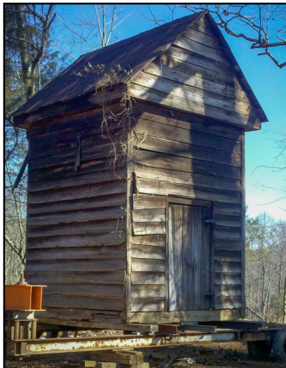
The smokehouse leaves its old foundation awaiting restoration.

need saving. Cemetery work continues. Work with County Planning continues. We are working on another Fried Rabbit publication. Historical research continues. There's the website, the newsletter, lots of communications with people interested and inquiring about the history of Chatham County. The Fourth Grade School program will start again very soon expecting to serve about 800 students. The doors of the museum and office continue to be open on Wednesday through Friday and on the First Sunday of most months. We soon will be having a fundraising campaign to bring the Smokehouse Back Home. Take a good look at the picture of the smokehouse (see below) when it was on the trailer ready to leave its old foundation to make way for the new. Help us bring it back.