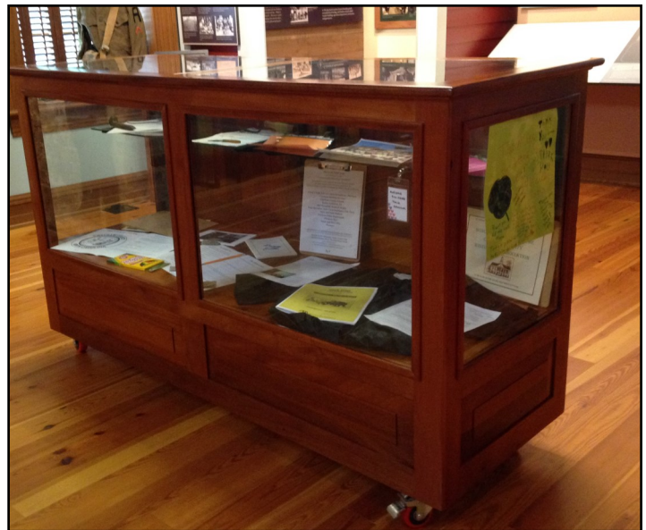
The display case inside the Museum was made from salvaged mahogany from the Courthouse made by Rouse Wilson, III. Note it has rolling casters which enables it to be moved around!