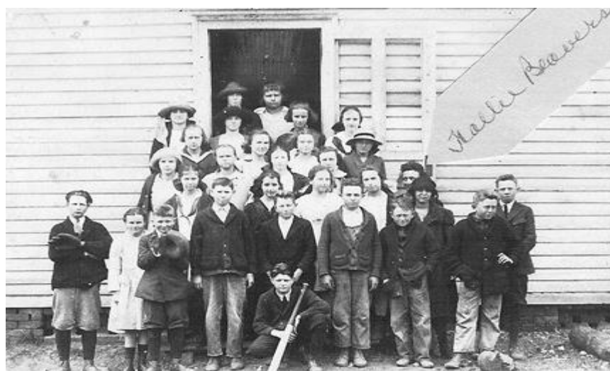
Teaching in Siler City in 1920-21