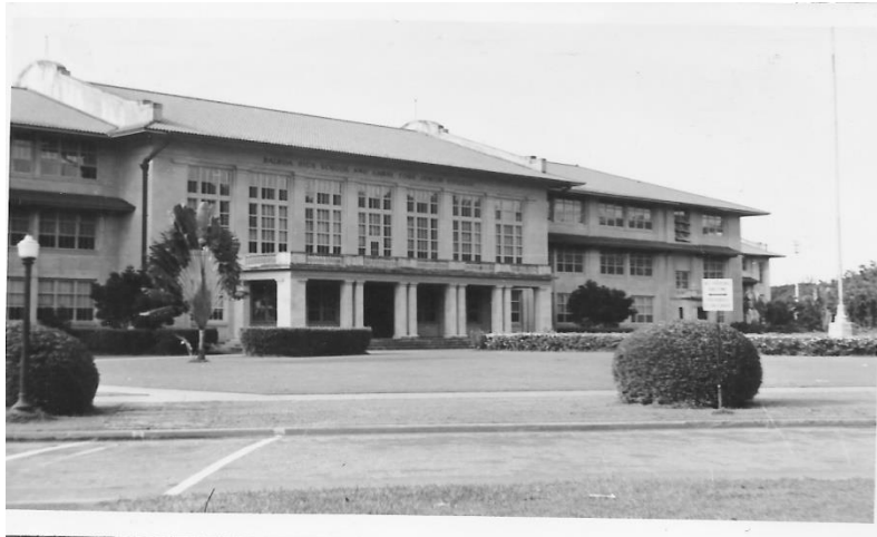
Balboa High School

Maryland and then spending the rest of the summer in Siler City. In 1945 she transferred to the Pacific side of the Canal Zone to teach school at Balboa High School.