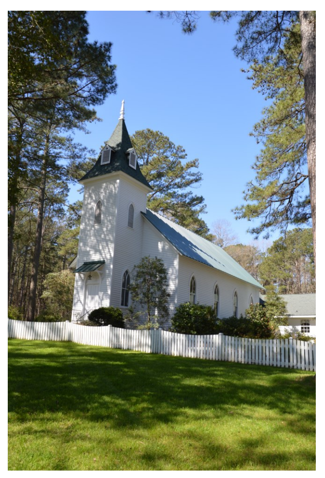
Ebenezer Methodist after being moved.

In 1971 the N&O reported that construction workers were about to begin pouring concrete for what was then referred to as the New Hope Reservoir dam. (In 1973 the project was renamed after Senator B Everett Jordan, chief champion of the dam project). At that time, construction of the dam was about 10% complete. The dam was expected to create a 14,300-acre lake. In addition to the dam construction, 19 miles of the Norfolk Southern Railway near the Chatham-Wake county line was being relocated. A short stretch of Highway 64 was also expected to be relocated by summer 1972. About 2.8 miles of the highway would cross the reservoir near Seaforth at completion of the dam, which was scheduled for spring of 1973.